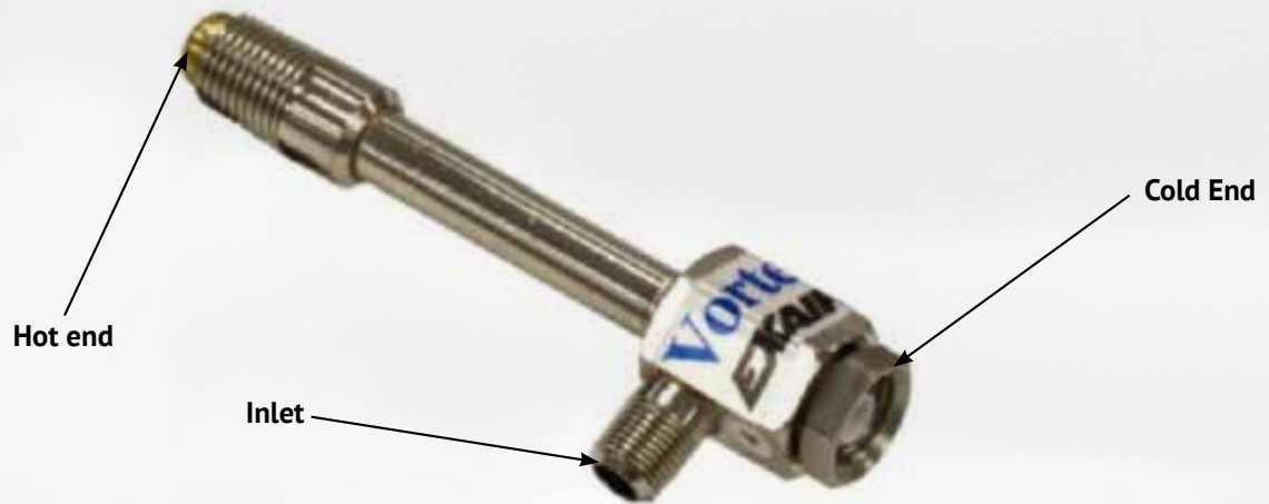
Figure 6. Vortex tube.