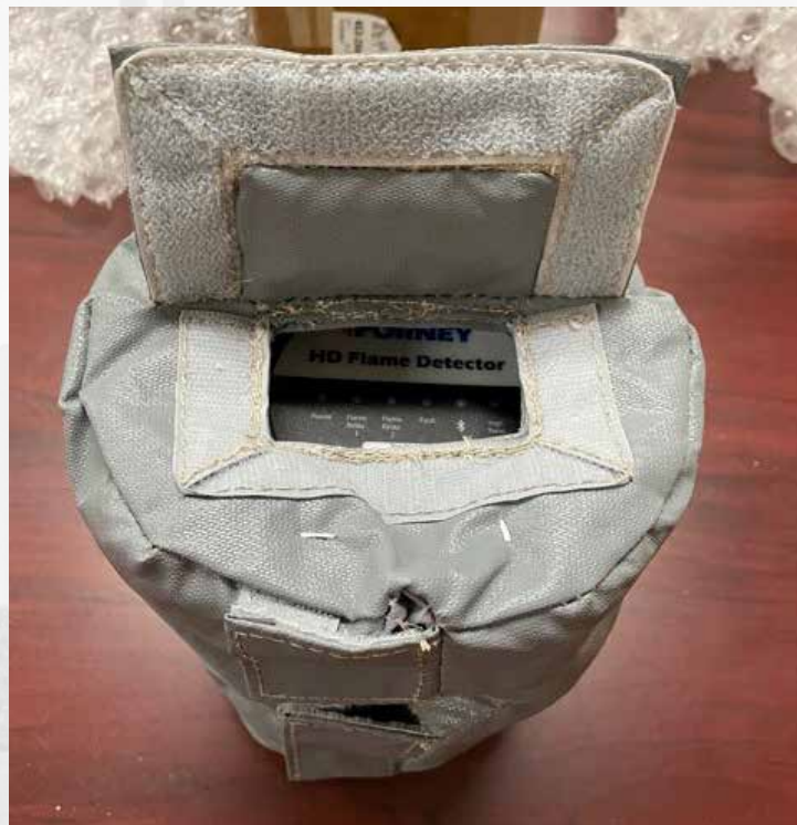
Figure 3. LED can be seen through window.