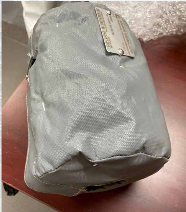
Figure 5. Closing on the jacket.