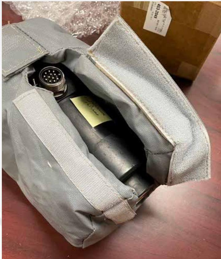
Figure 2. HD is inside the jacket.