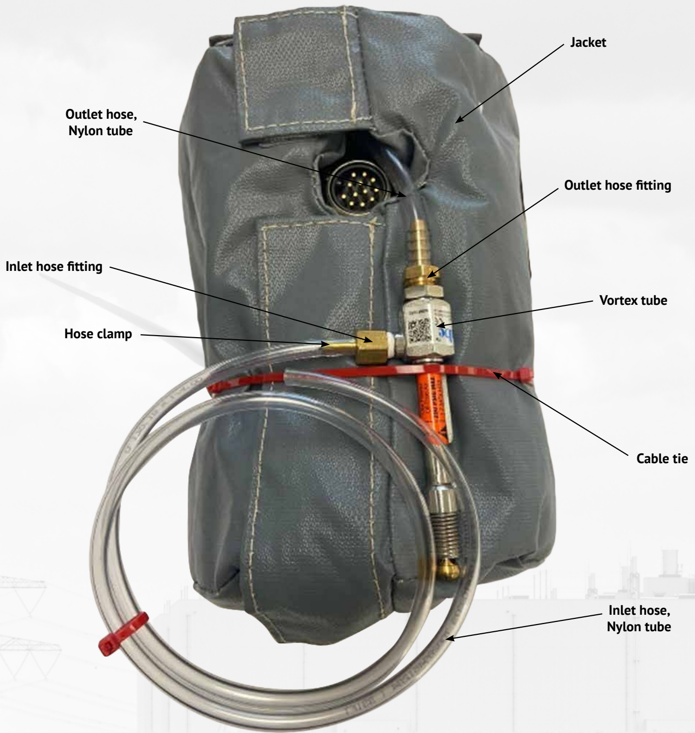
Figure 1. The cooling jacket system.