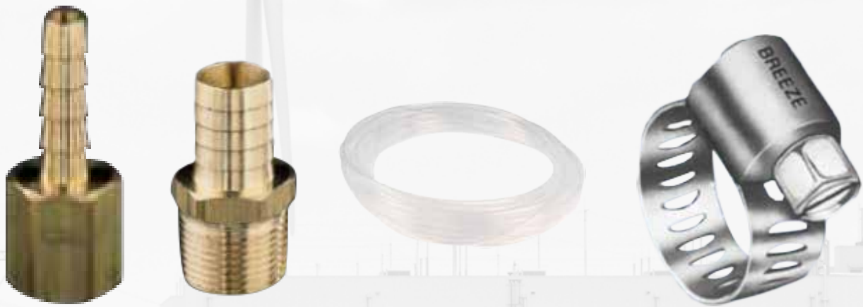
Figure 7. Brass hose inlet and outlet fittings, Nylon tubing (5/16\"