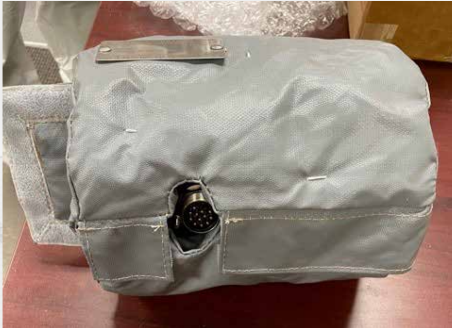
Figure 4. Cable connector is accessible.