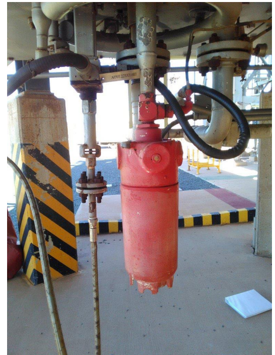
Existing Fireeye 45UV5 Series flame scanners at gas plant

With multiple lengthy distances between the burner front and the control rack room, any re-cabling could be a costly exercise. A solution that utilized existing cable and kept installation cost and time to a minimum was required.