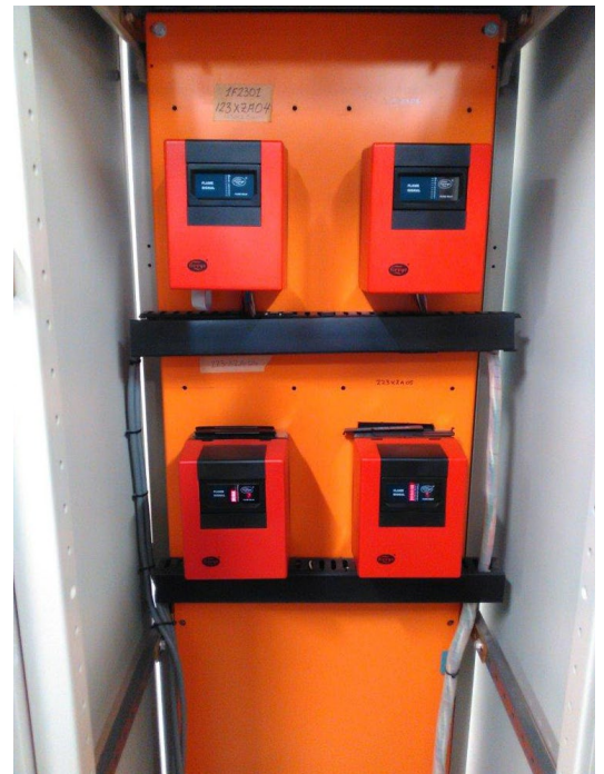
Existing Fireeye Flame-Monitors at gas plant